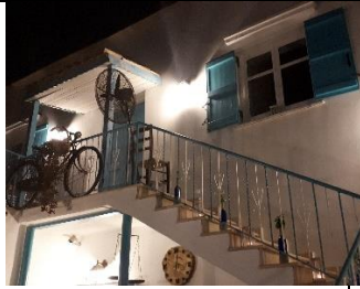
Old Aradippou house