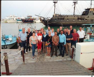
Conference family photo at Ayia Napa harbor