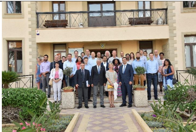
A family photo of the conference delegates outside the Aradippou Town Hall before the cocktail and the Tour at the traditional villages of Lefkara and Vavatsinia kindly sponsored by the governmental organisation, Cyprus Tourism Organisation