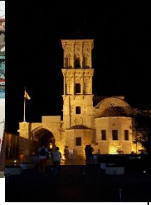
The 1100 years old church and the tomb of Saint Lazarus in Larnaca