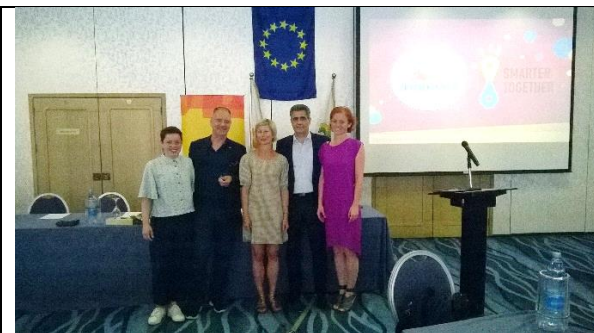
Mayor of Aradippou welcomes the Smarter Together and INNOVATE representatives

Aradippou Municipality and the Larnaka Chamber of Commerce and Industry representatives already working on ‘Smart City Aradippou’ actions for the last 3 years and currently co-designing their INNOVATE One-Stop-Shop in Aradippou, have expressed their commitment for sustaining the Conference on a permanent yearly basis.