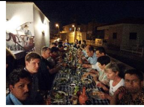
Dinner offered by the Mayor of Aradippou to the conference delegates at a traditional tavern in Aradippou